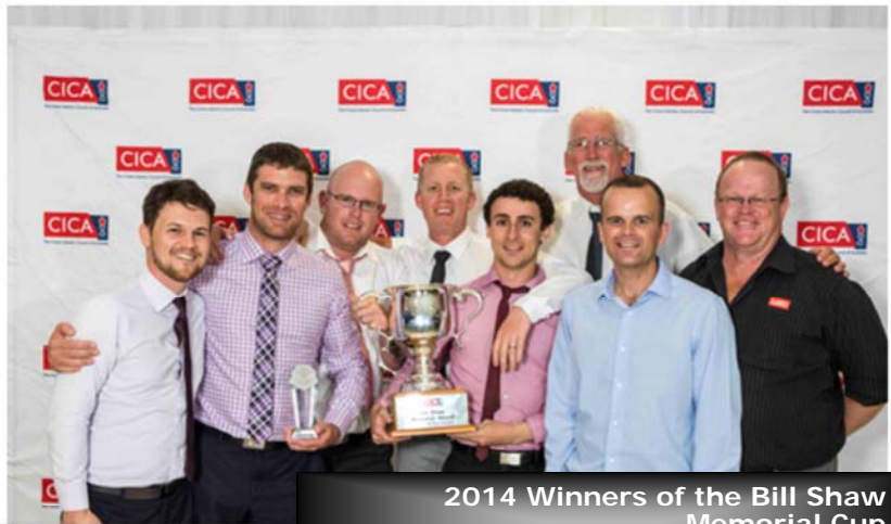
2014 Winners of the Bill Shaw Memorial Cup Presented to the team at John Holland Pty